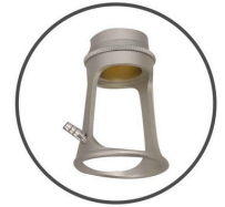
Láser CO2 Fraccionado para tratamiento facial