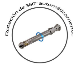
Láser CO2 Fraccionado para estiramiento vaginal