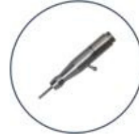
Pieza de mango