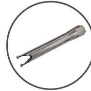
Punta del cuello uterino