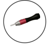
Láser CO2 para cirugía