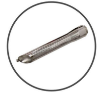
Punta de vulva